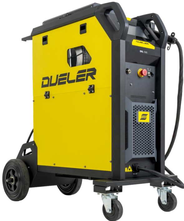
Dueler EHL 1500